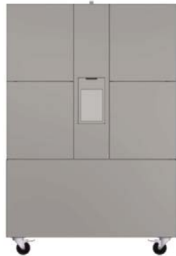
PUC-A-22 shown with optional stand